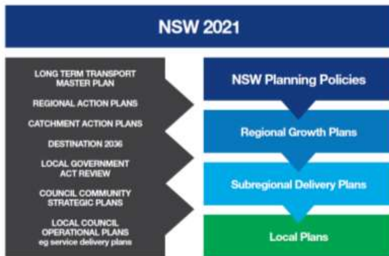
Figure 2 Relationship between strategic planning and other state plans and reforms (Department of Planning and Infrastructure 2013a p67)