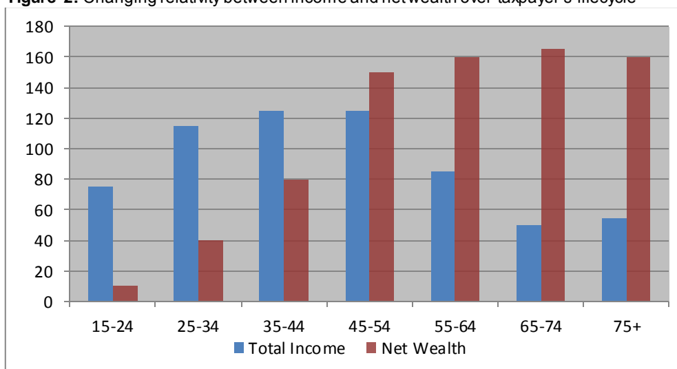
Figure 2: Changing relativity between income and net wealth over taxpayer’s lifecycle